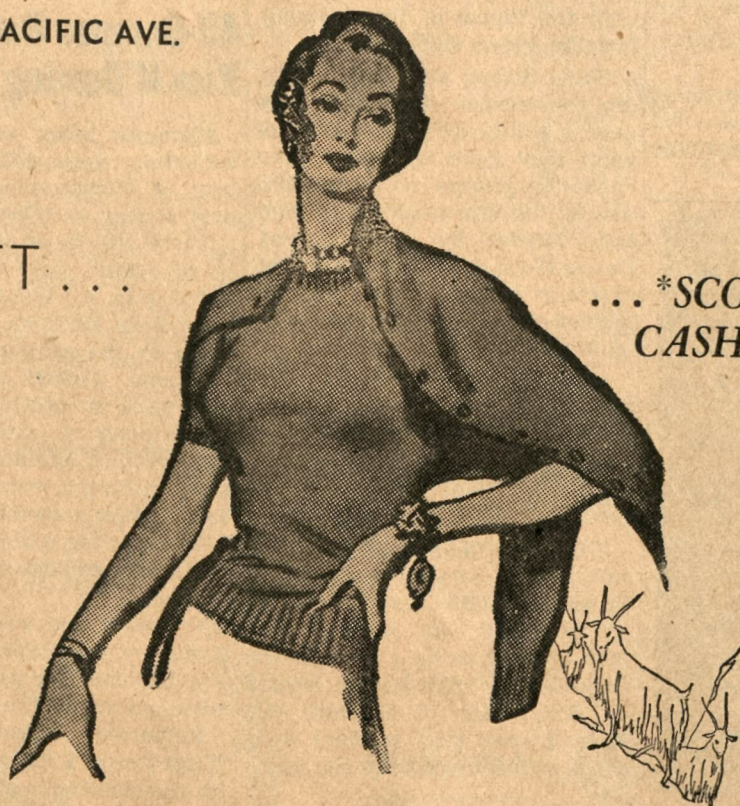
Milton Moth Proofed

The world's most treasured sweater, perfected by Master-Craftsmen of Scotland. Wear them and revel in their incredible luxury. Yet Lyle and Scott's are durable too. Available in many heavenly moor-misted colors. From 19.95.