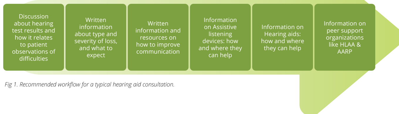
Fig 1. Recommended workflow for a typical hearing aid consultation.

An effective way to ensure that a person understands their diagnosis and the available options to help mitigate their communication difficulties is shown below.