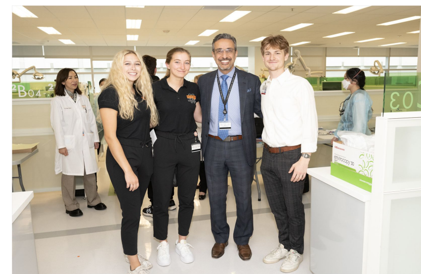
Senior Smiles 2023