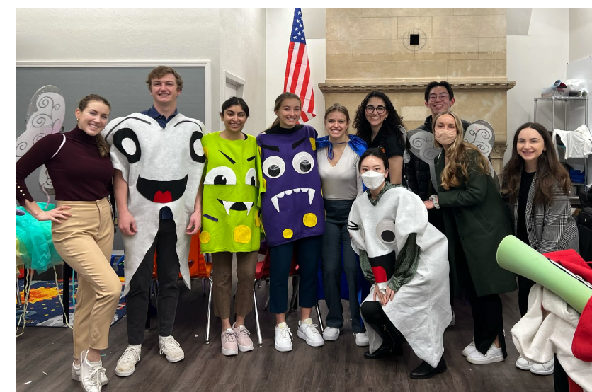
San Francisco City Impact 2023