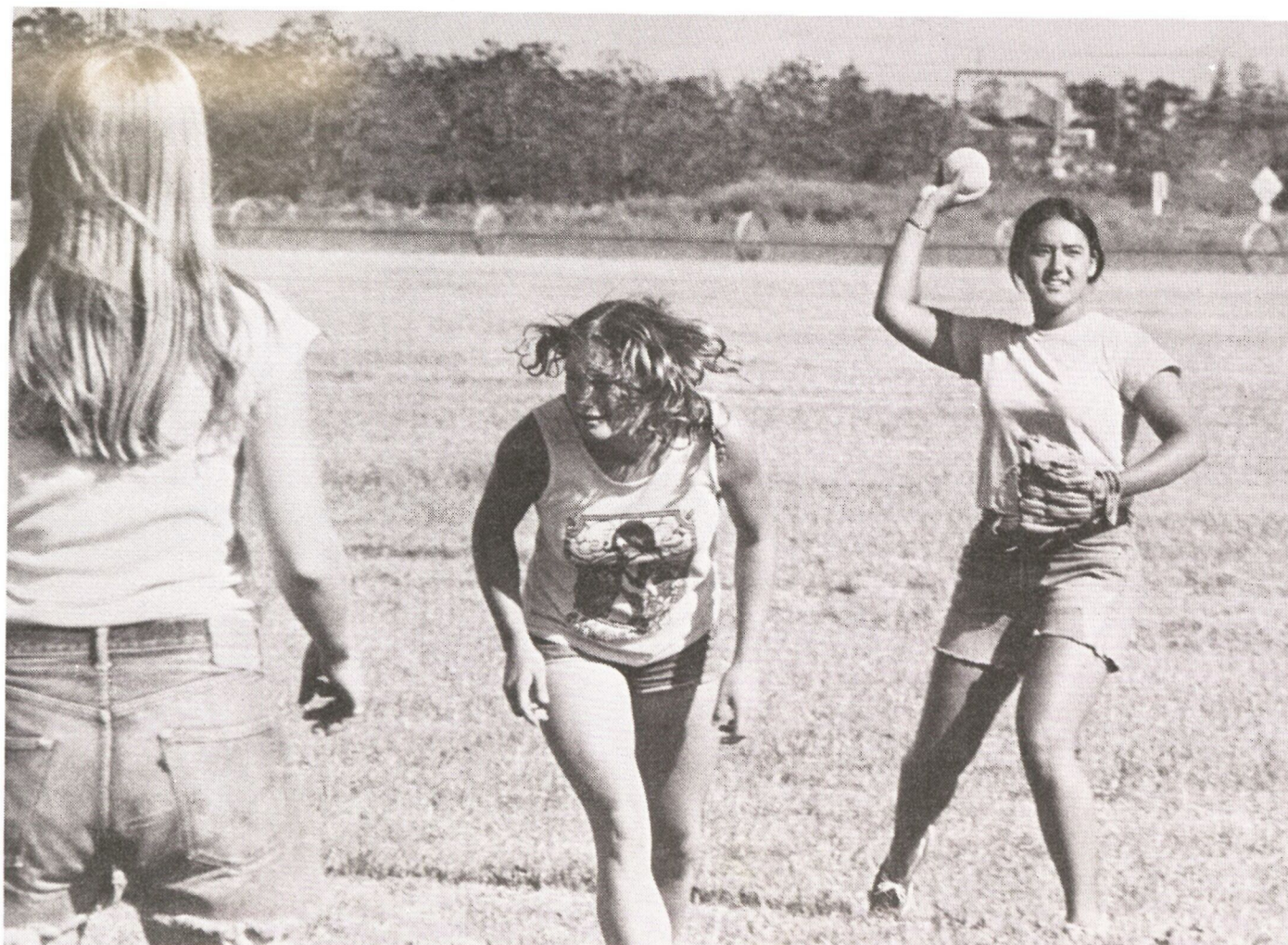
Women's softball teams are one of several intramural sports activities on campus.