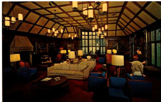
Raymond's Common Room

Any student who was there in 1967 would swear we did our lion's share of intense reading and writing but primarily we were basking in the hilarity of our newfound communal brilliance as we gathered outside in the Quad, inside the Common room, sitting on concrete steps going anywhere up.