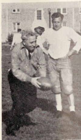
Grand Old Man

Even in defeat the College of the Pacific can be proud of laurels won in the game with the University of California, in Berkeley Memorial Stadium, October 16.