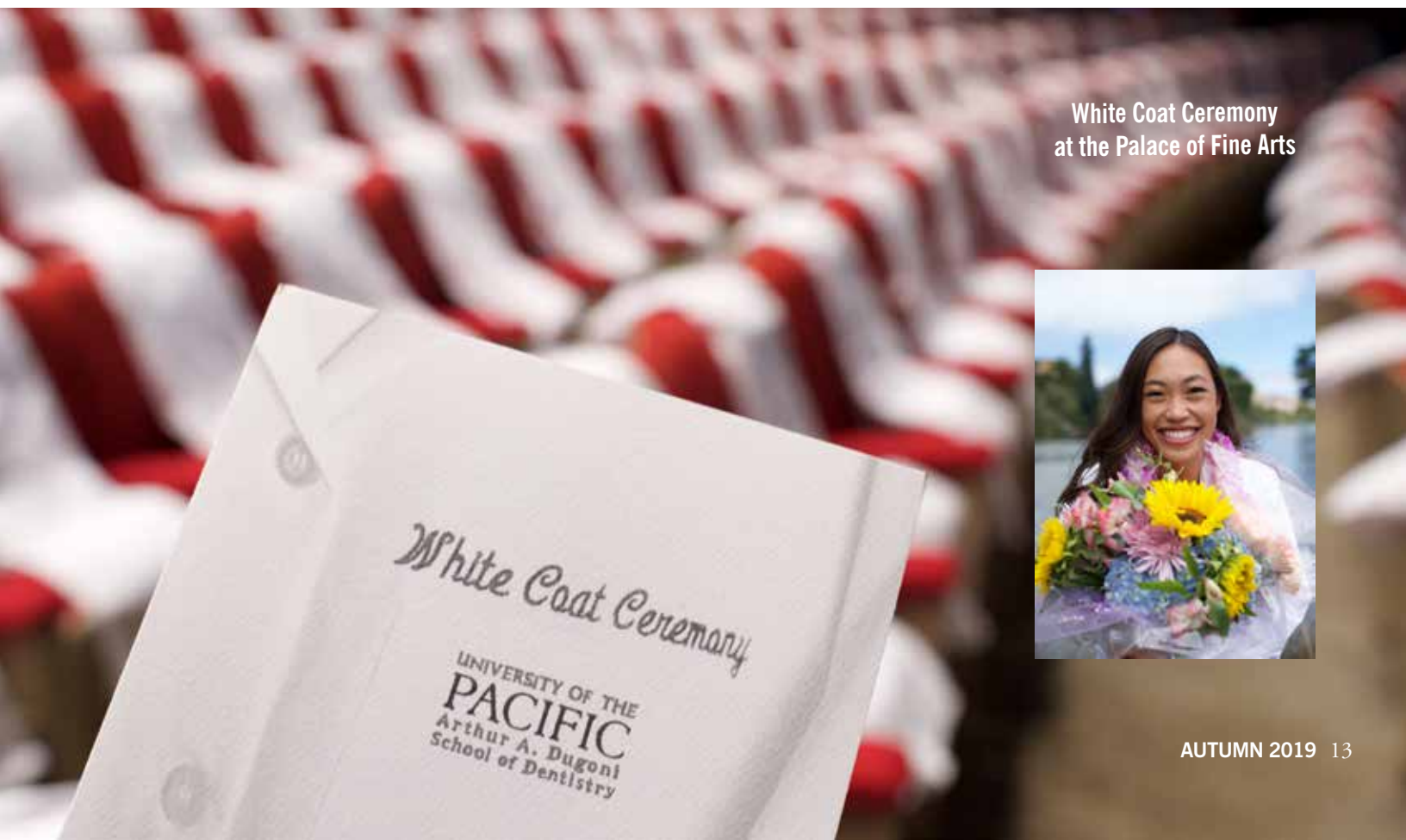
White Coat Ceremony at the Palace of Fine Arts