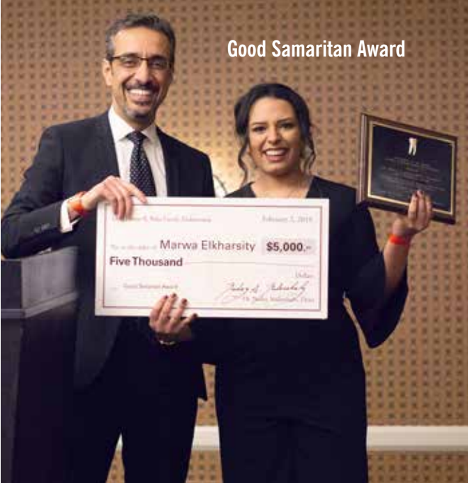
Good Samaritan Award