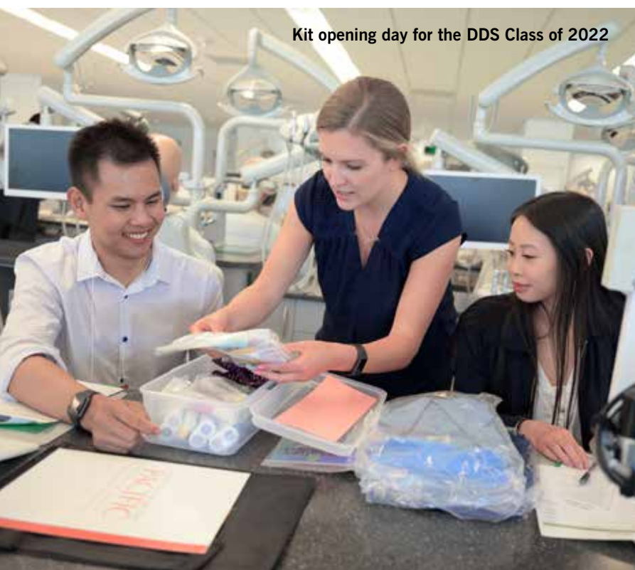
Kit opening day for the DDS Class of 2022