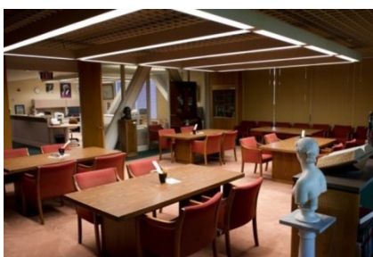
Holt Atherton Library Archives

Ninety plus online interviews are available for viewing via the Emeriti Society website and via the Holt Atherton Library Special Collections/Archives.