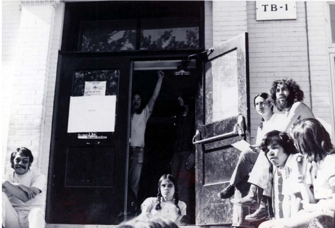
Photo 4. Chicano student occupation of TB-1, University of Colorado-Boulder, ca. 1970s.

Although several initiatives exist in Pueblo to document this history, including collections at the El Pueblo Museum, the Bessemer Historical Society, and the Southeastern Colorado Heritage Center, the cultural heritage of the region was still at risk of being lost because no one institution had a mission to specifically focus on preserving archival collections documenting the history of cultural communities in Pueblo.