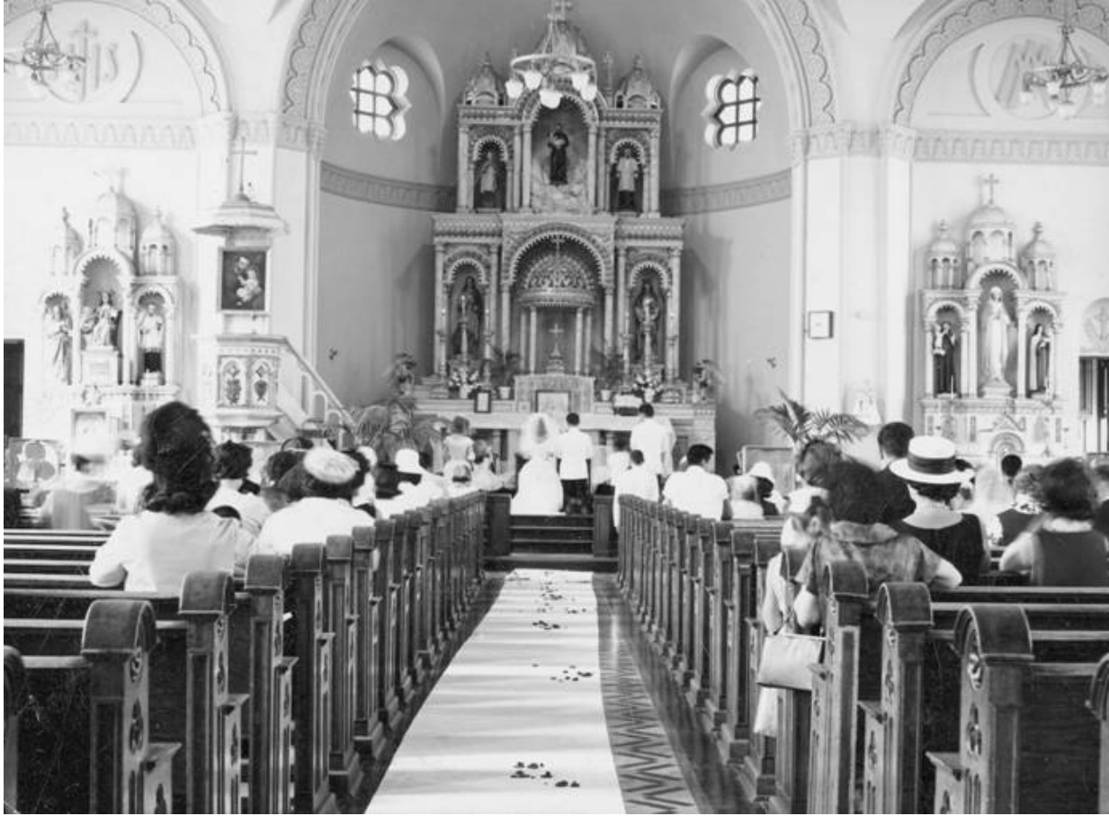
Photo 1. Interior view of St. Cajetan's Catholic Church, 1190 Ninth Street, in the Auraria neighborhood, Denver, Colorado. Lupe Morales and Gene Vigil (shown), kneeling at the altar during their marriage in the 1950s. Family and friends, most likely from the Auraria neighborhood, are in attendance.

theatre production. Titled Westside Oratorio , this original work honors the sacrifices made by Displaced Aurarians, a predominantly Hispanic community evicted in the early 1970s to permit construction of a tri-institutional higher education campus in downtown Denver. 3