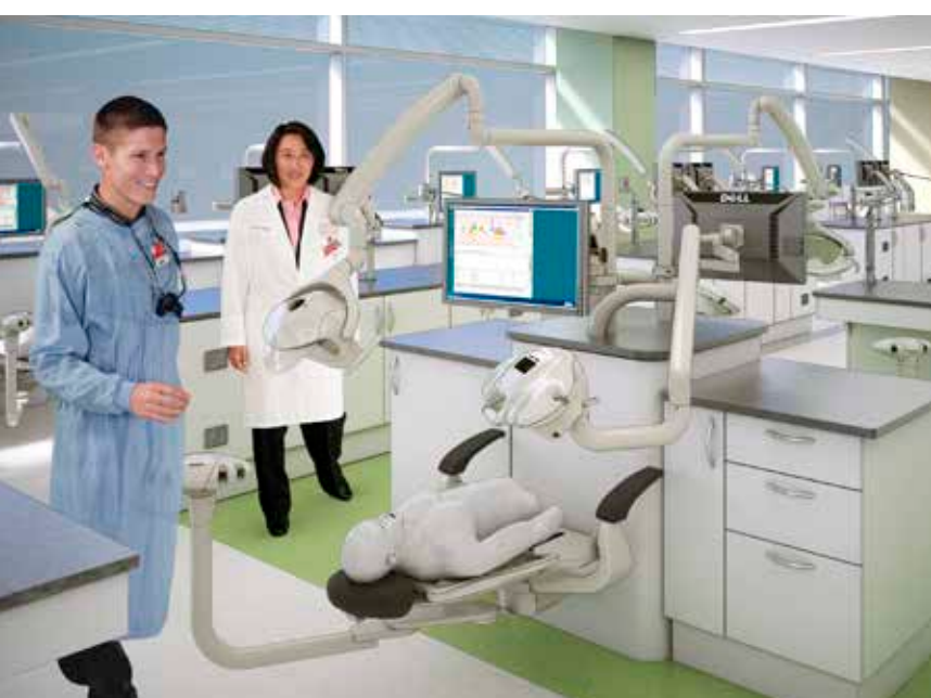
A rendering shows a sample station in the new Sim Lab.