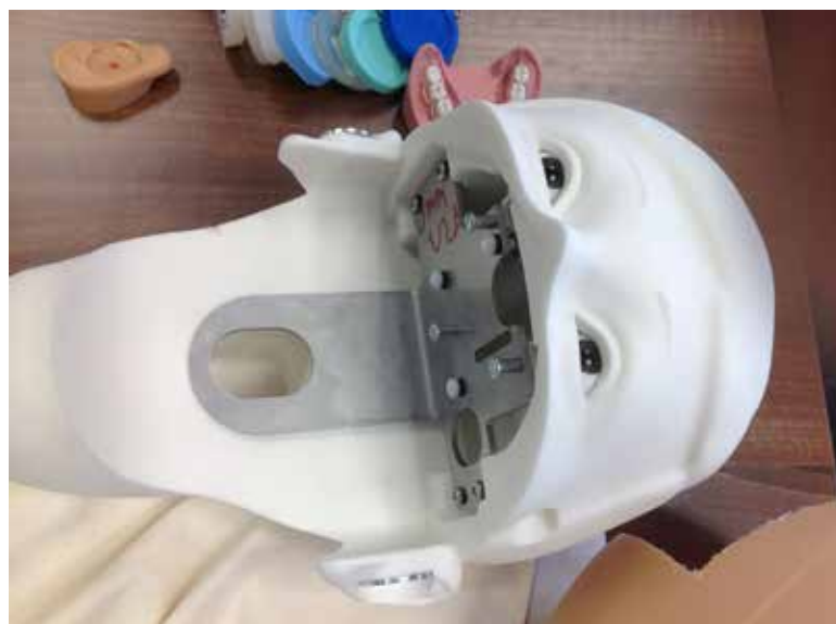
A view of part of the custom mannequin designed for Pacific Dugoni.