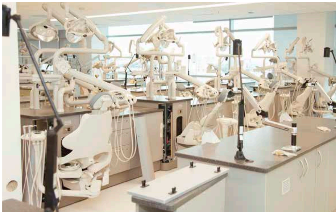
New equipment and upgraded technology is being installed this spring at 155 Fifth Street.

Chairs, cabinets and other equipment have been installed into operatories located on the second and third floors. Technology yet to be installed includes electric hand pieces, mounted microscopes in each operatory in the endodontic clinic, mobile microscopes and NOMAD hand-held portable X-ray units. The school will also expand the use of CAD/CAM technology, with a dedicated room featuring four machines.