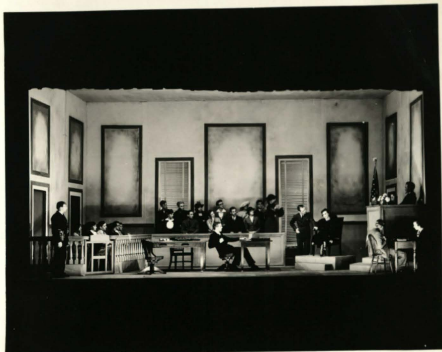
-LADIES OF THE JURY-