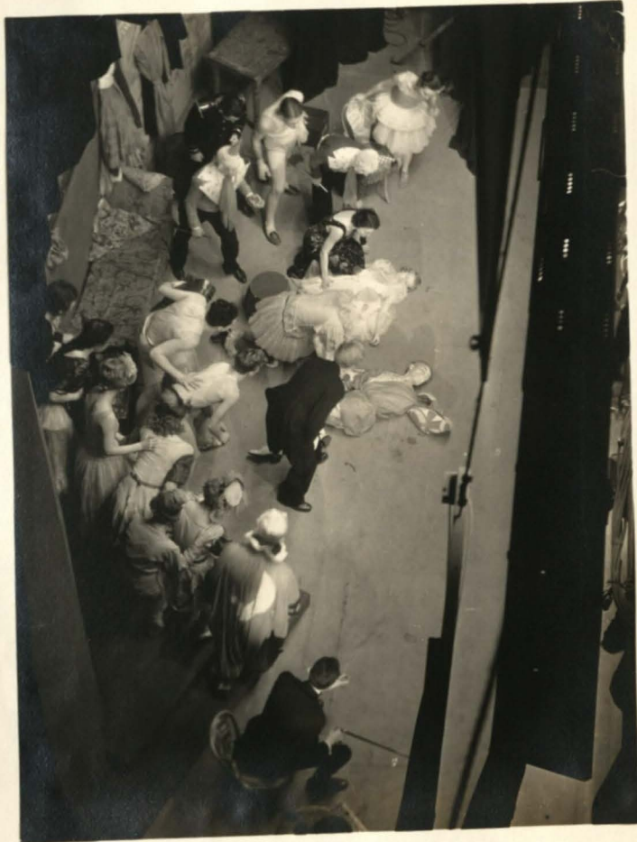
-HE WHO GETS SLAPPED-