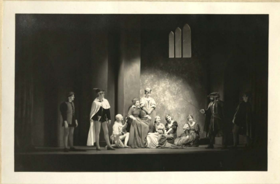
-ELIZABETH THE QUEEN-