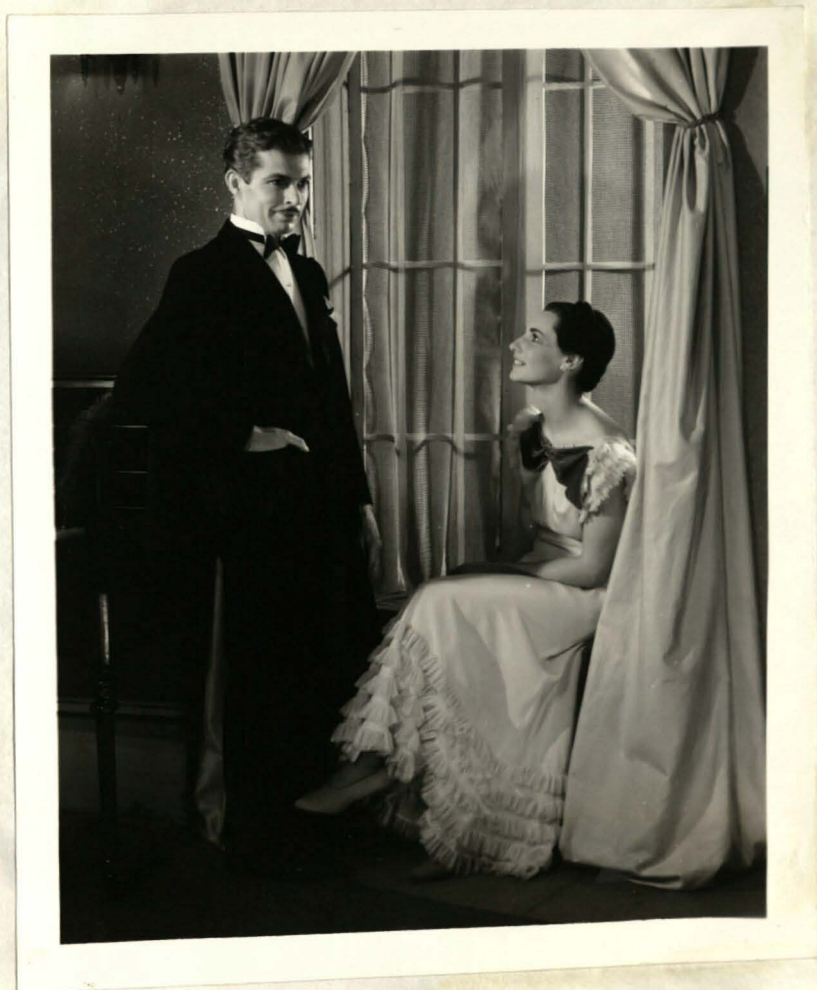
-THE GREEN BAY TREE-