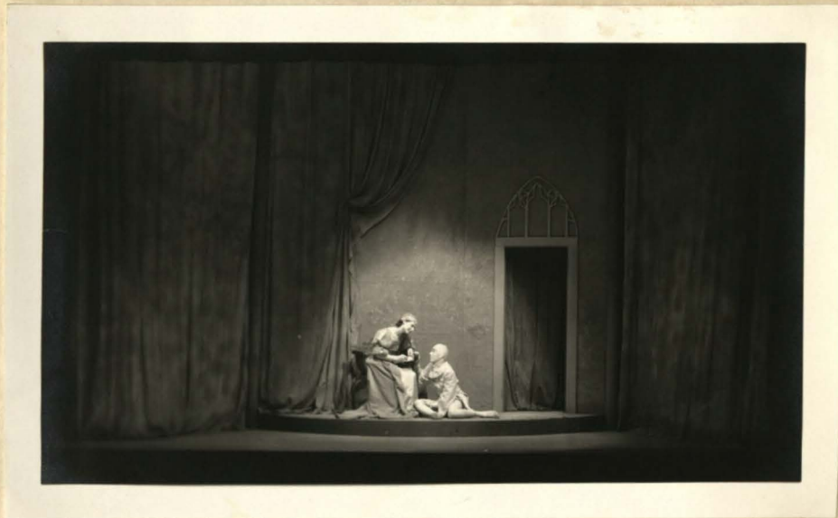
-ELIZABETH THE QUEEN-