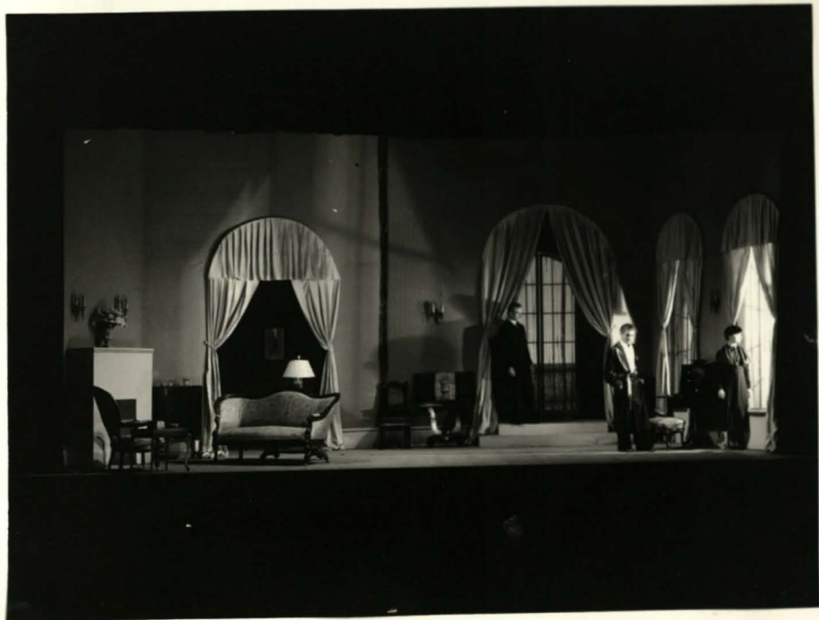
-THE GREEN BAY TREE-