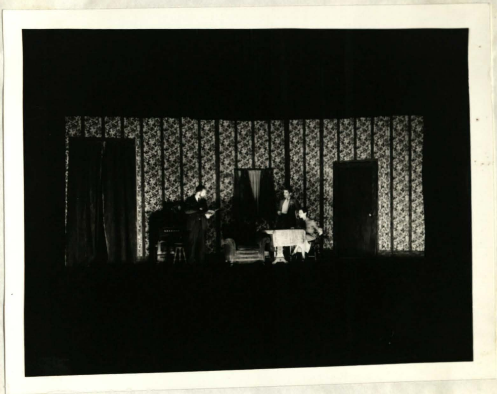
-THE GREEN BAY TREE-