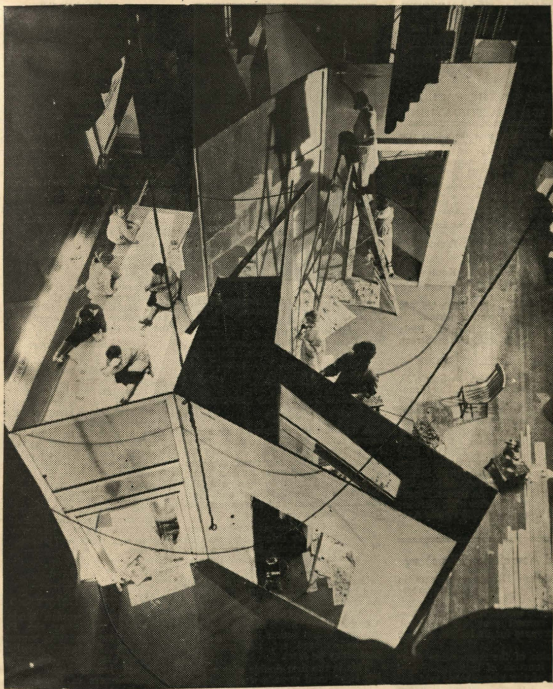
Pacific Little Theatre Revolving Stage