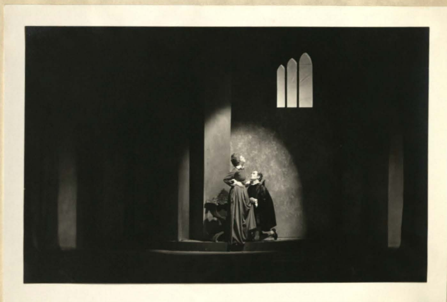
-ELIZABETH THE QUEEN-