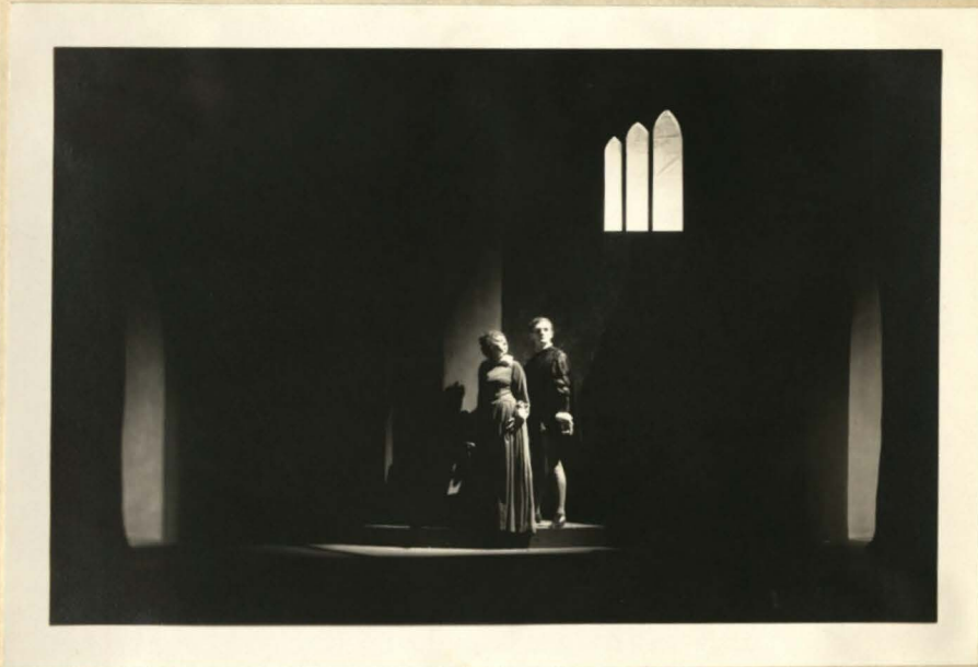
-ELIZABETH THE QUEEN-