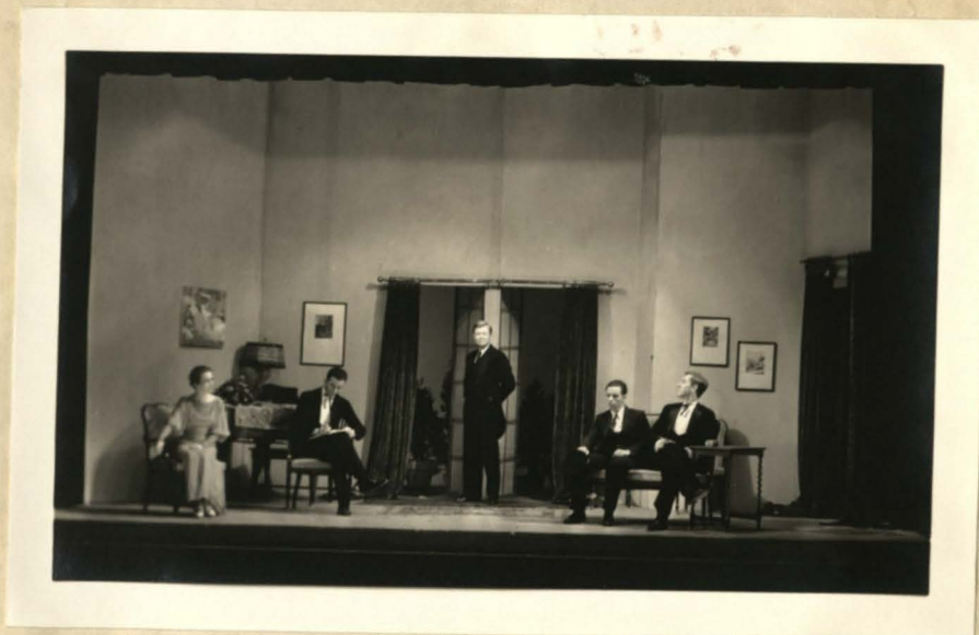
-THE LAST OF MRS. CHENEY-