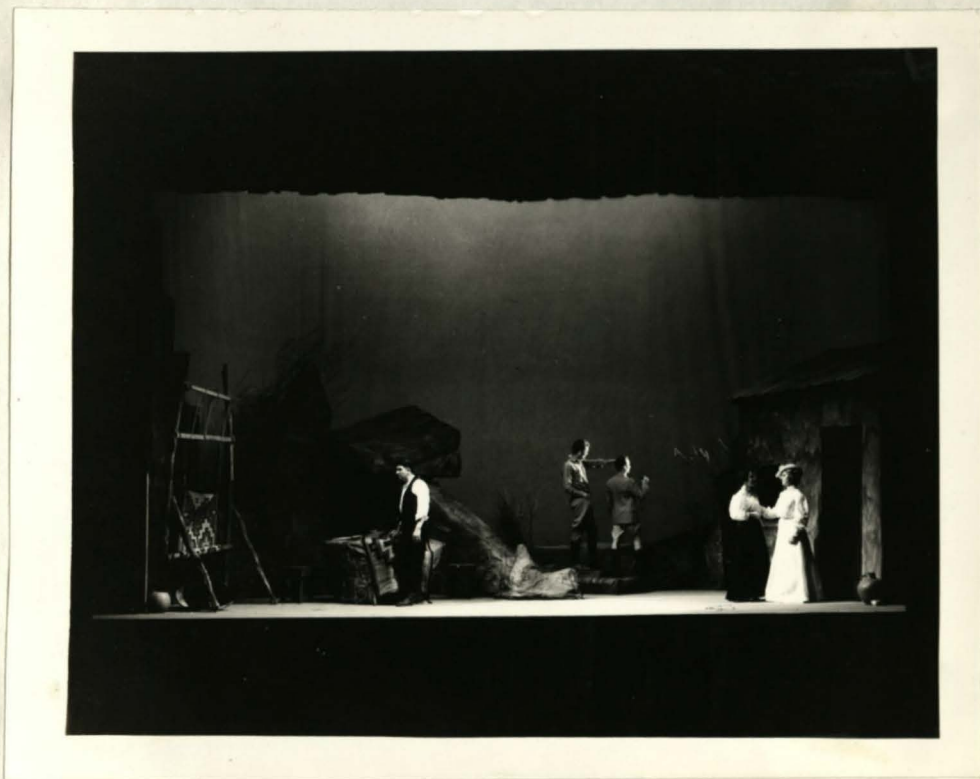
-THE GREAT DIVIDE-