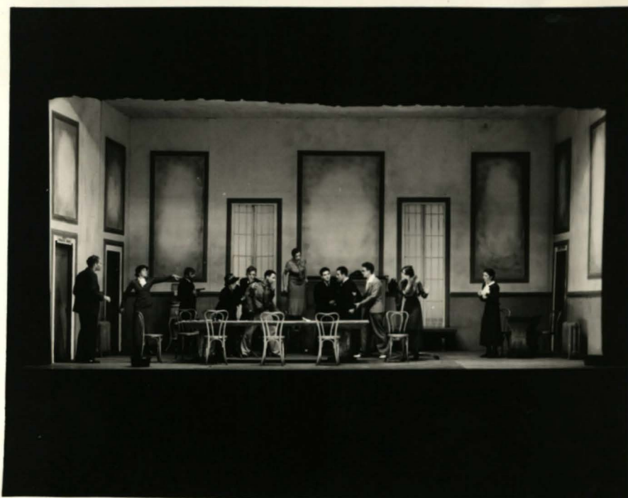
-LADIES OF THE JURY-