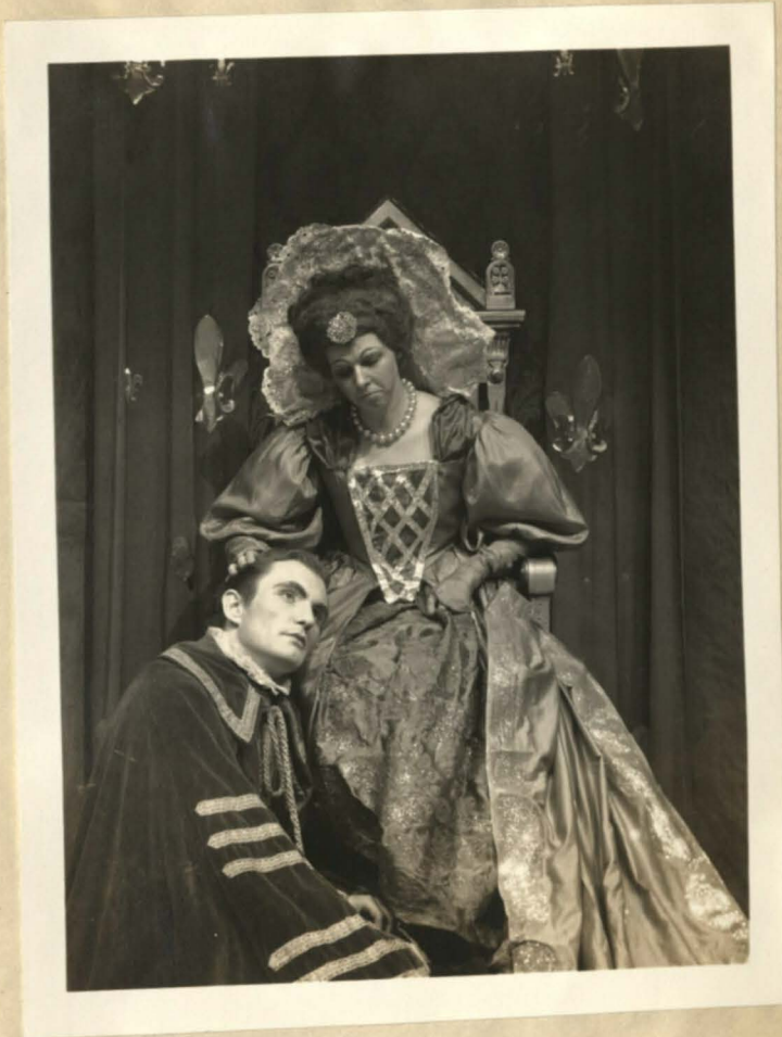
-ELIZABETH THE QUEEN-