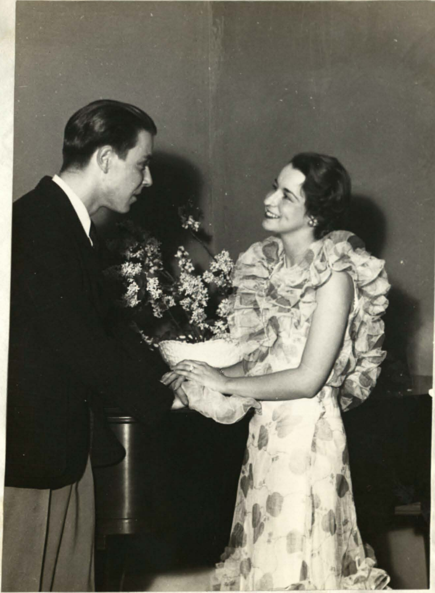
-MARY, MARY, QUITE CONTRARY-