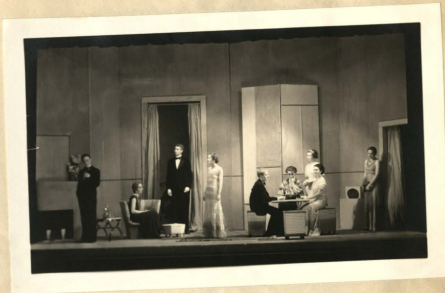
-THE LAST OF MRS. CHEYNEY-