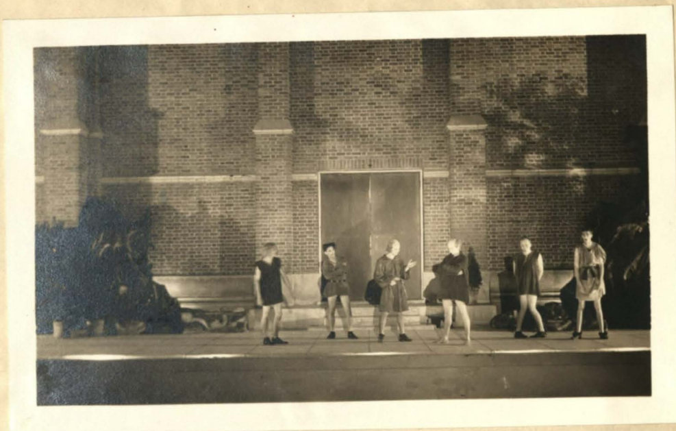
- A MIDSUMMER NIGHT'S DREAM -