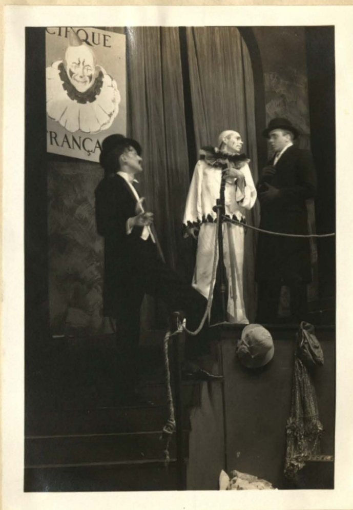
-HE WHO GETS SLAPPED-