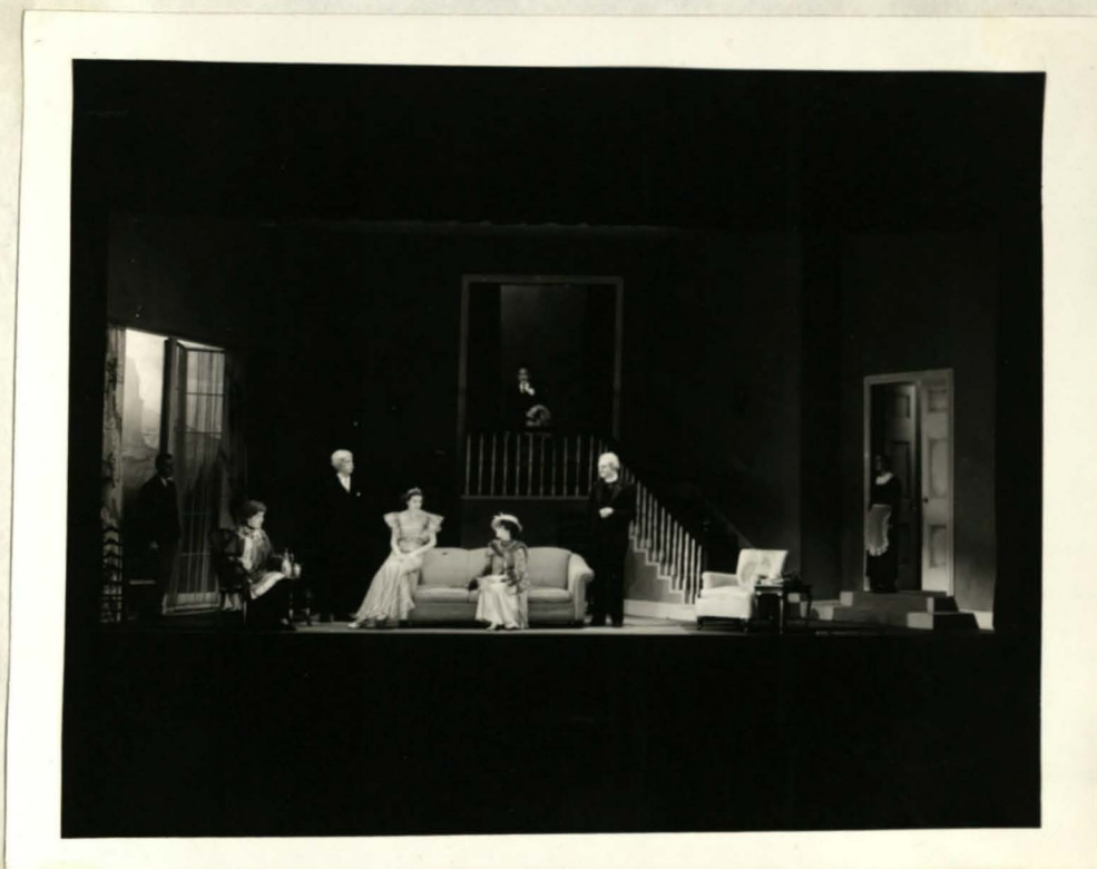
-MARY, MARY, QUITE CONTRARY-