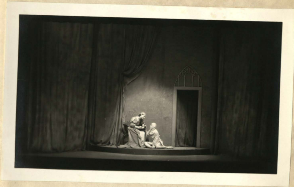
-ELIZABETH THE QUEEN-