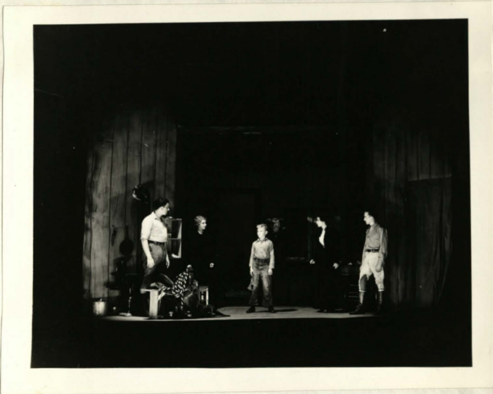
-THE GREAT DIVIDE-