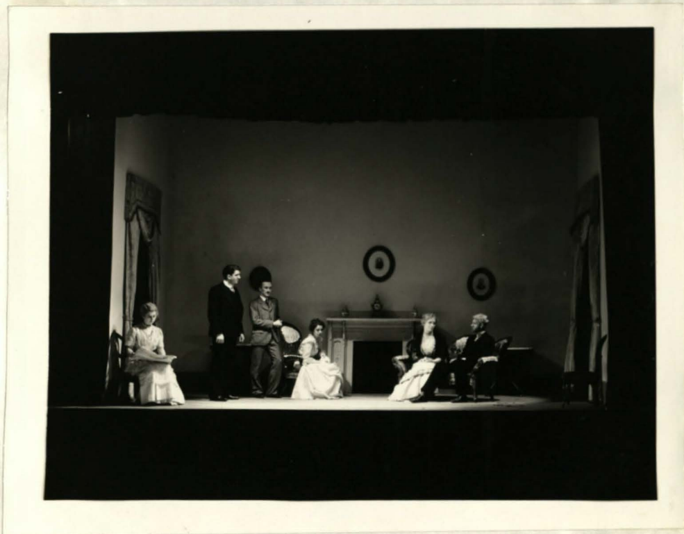
-THE GREAT DIVIDE-