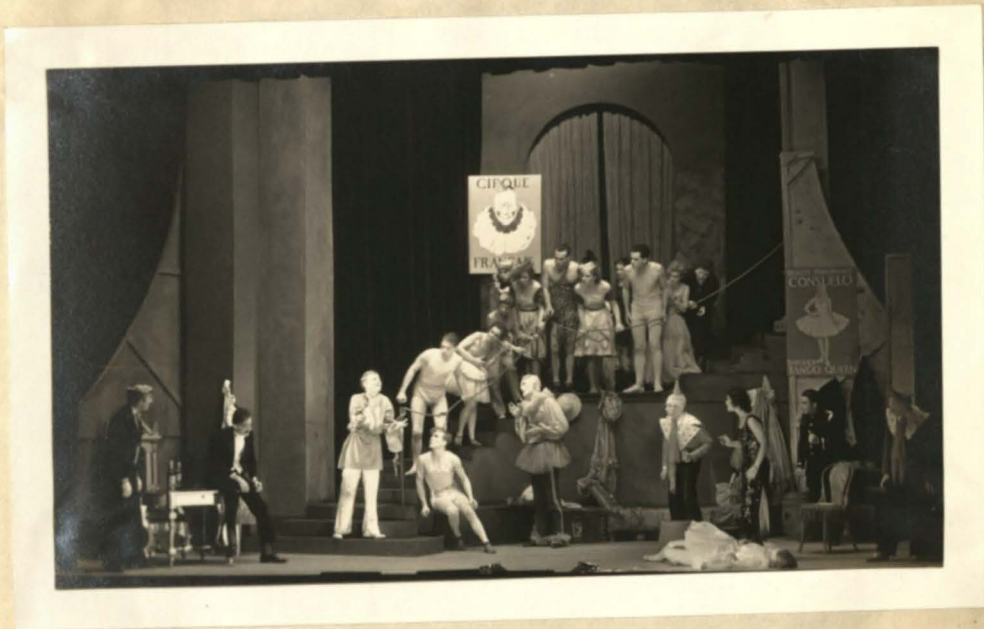
-HE WHO GETS SLAPPED-