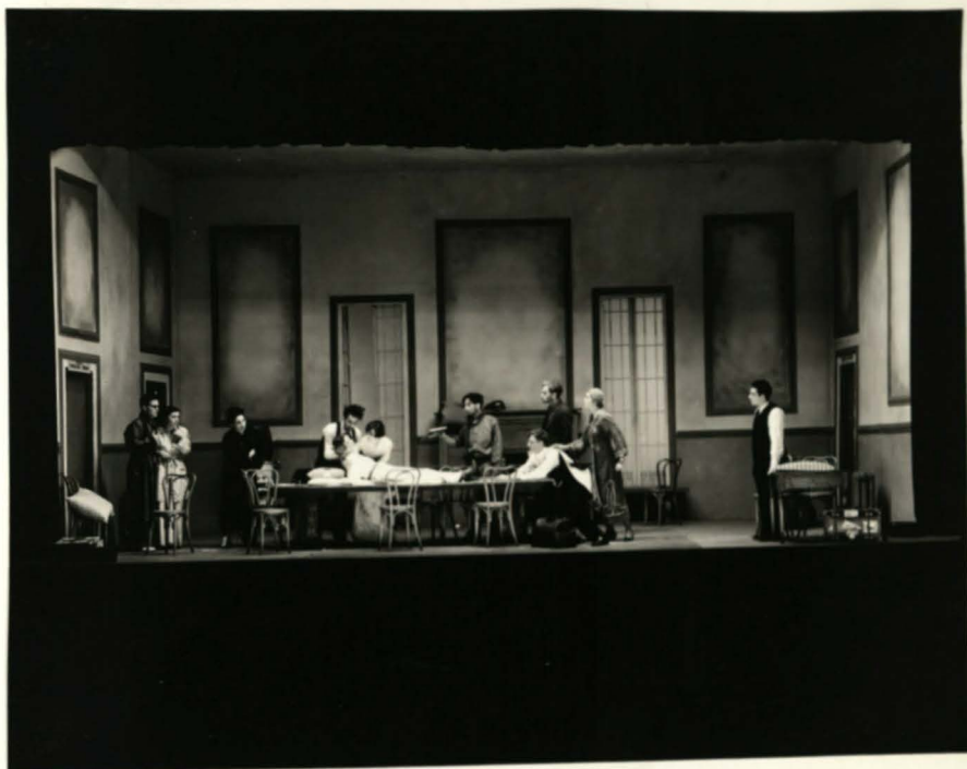
-LADIES OF THE JURY-