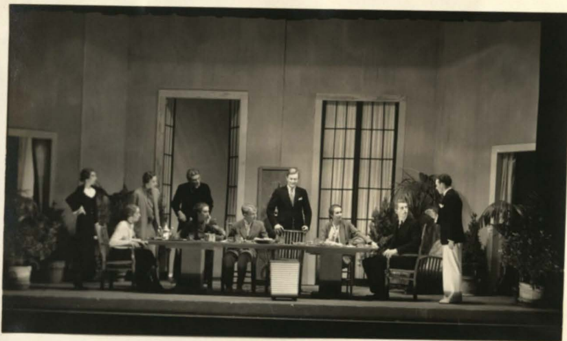
-THE LAST OF MRS. CHEYNEY-