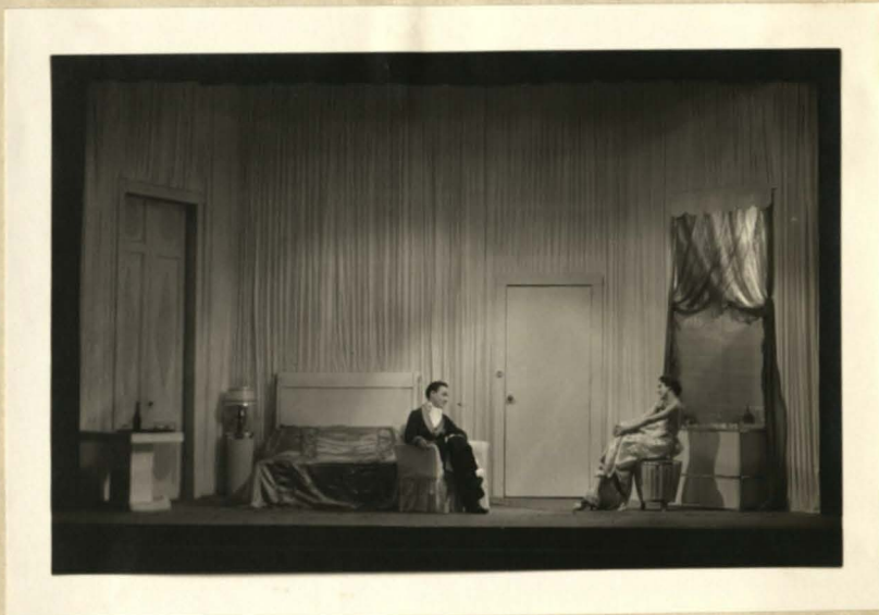
-THE LAST OF MRS. CHEYNEY-