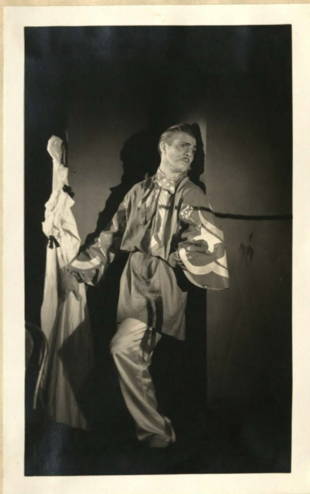
-HE WHO GETS SLAPPED-