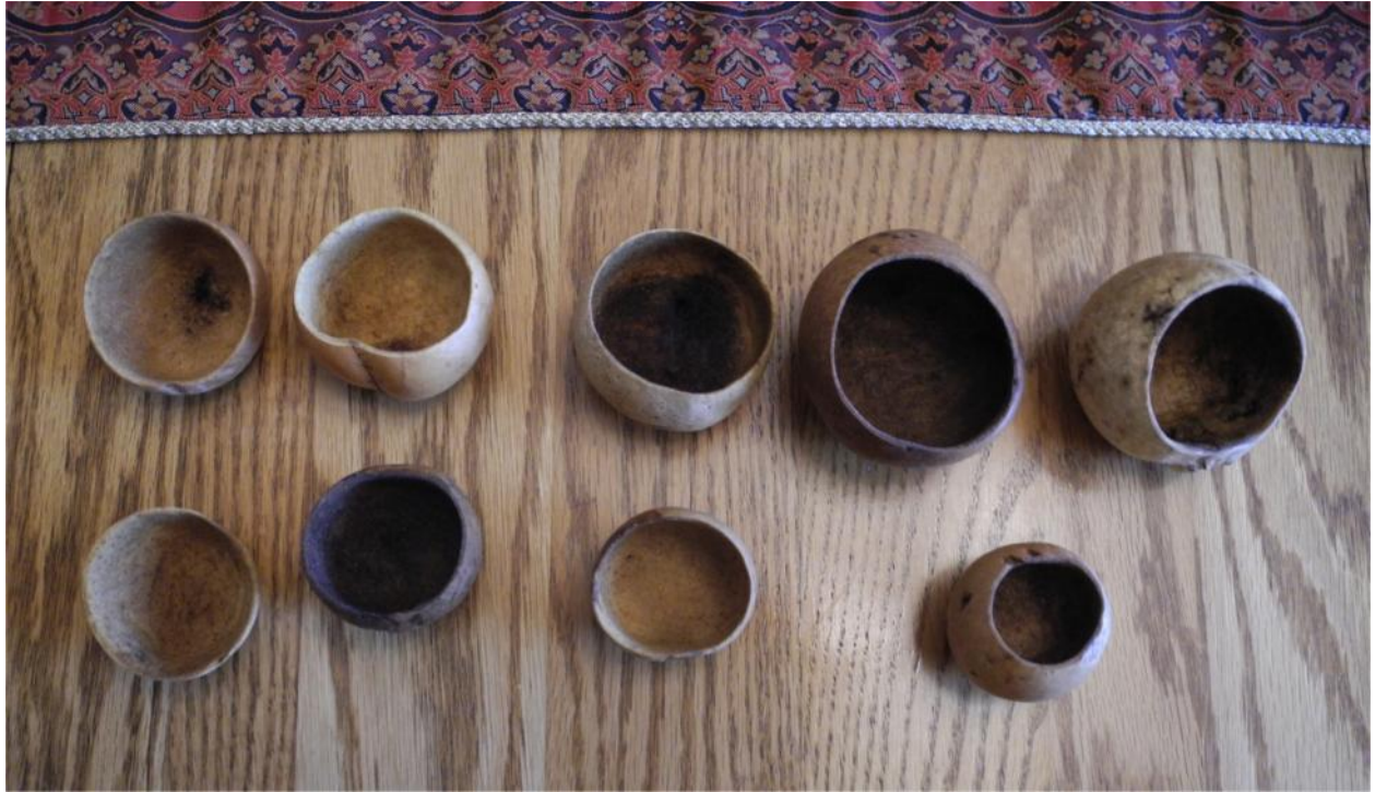
Oak galls – carved out