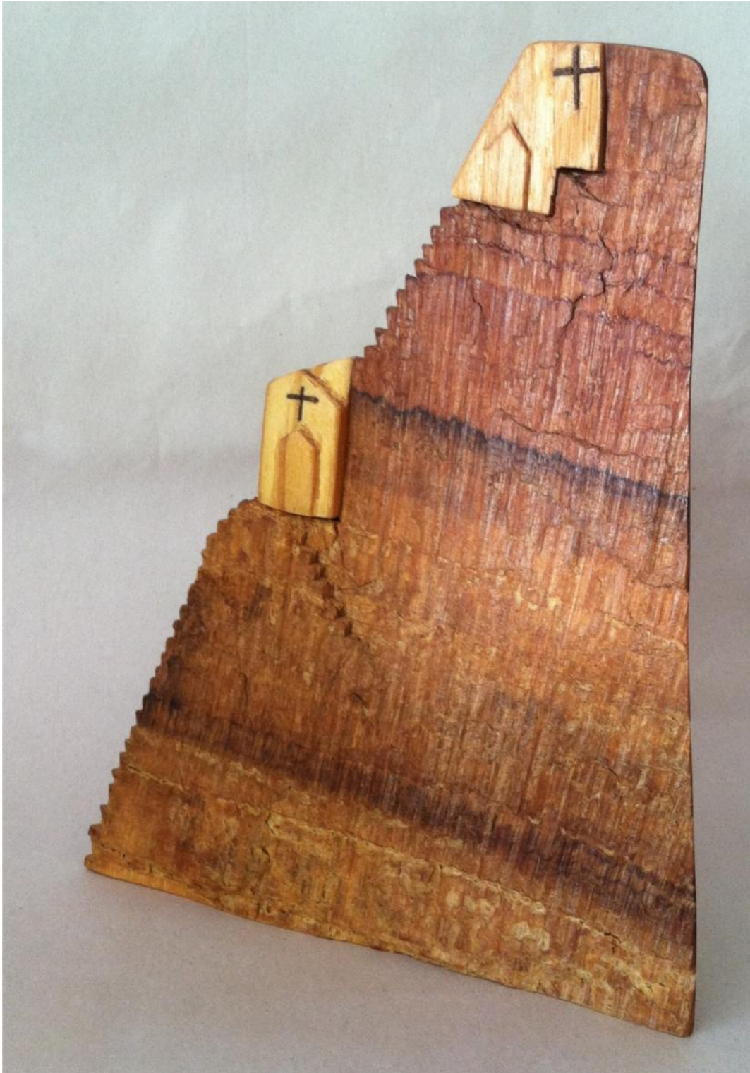
Sacred Mountain II – pine on carved redwood, reclaimed from firewood