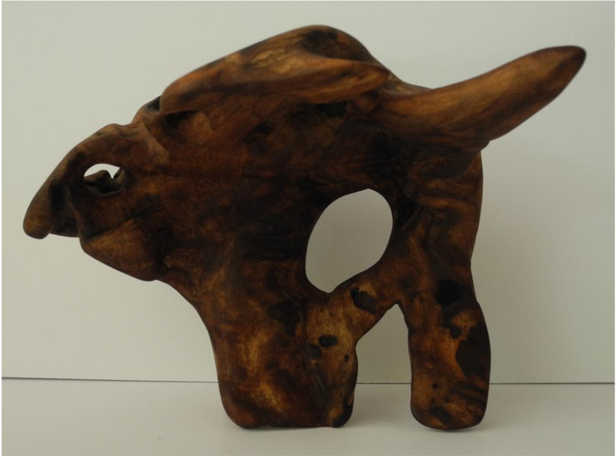
Convolutd - carved driftwood. Holes were made where rotted wood was scraped.