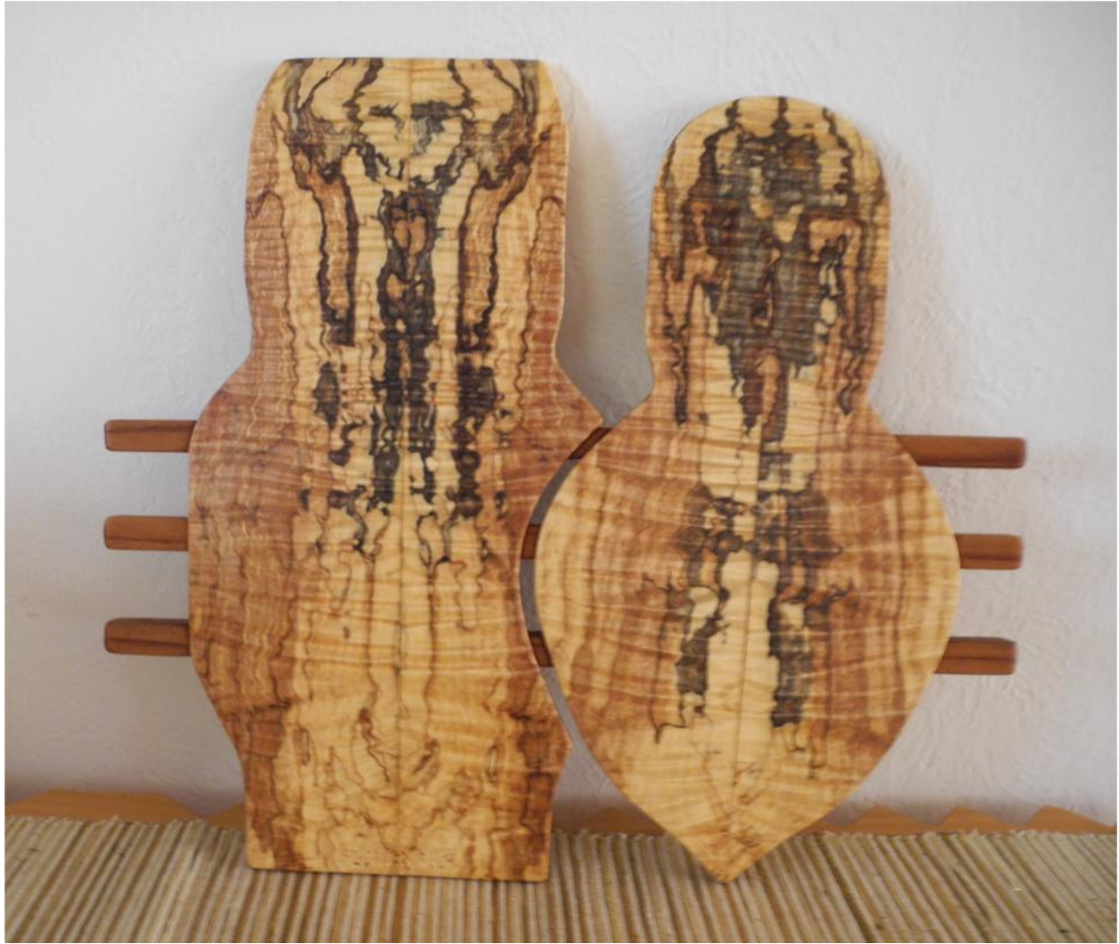
Couple – spalted maple sliced and book-matched on redwood bars. The coloration and patterns were caused by fungi.