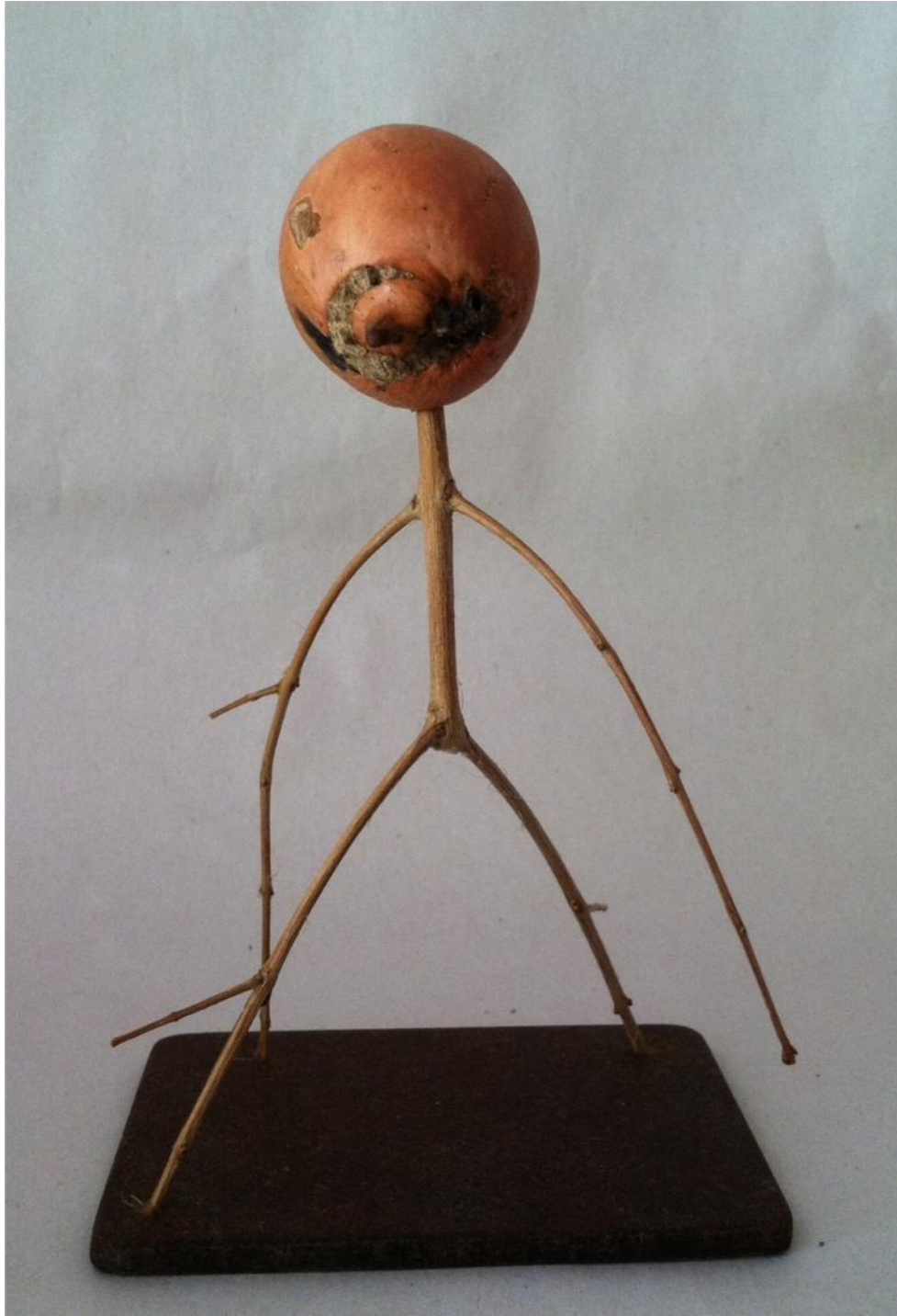
Oak gall and pomegranate branch on fiber board