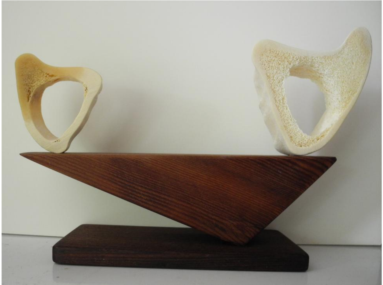
Balance – shank bones on redwood