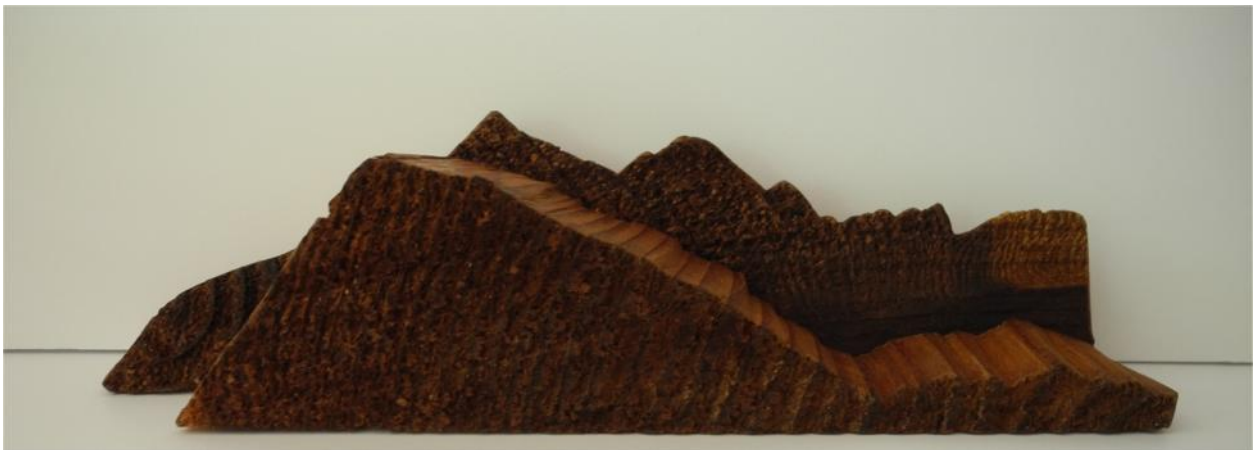
Mountain II – redwood from firewood pile