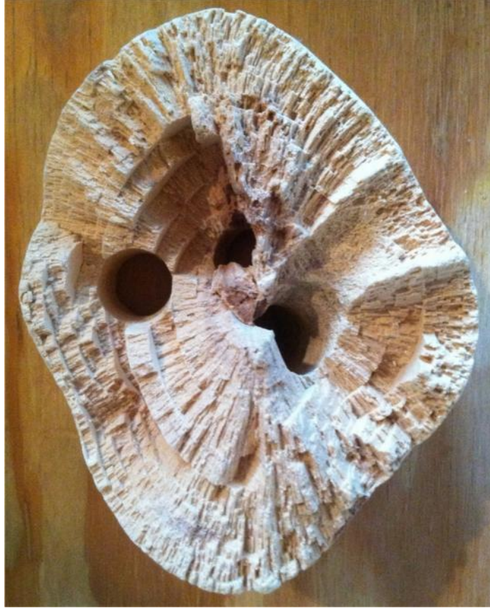
Mountain I – birch, fractured branch weakened by holes made by carpenter bees.