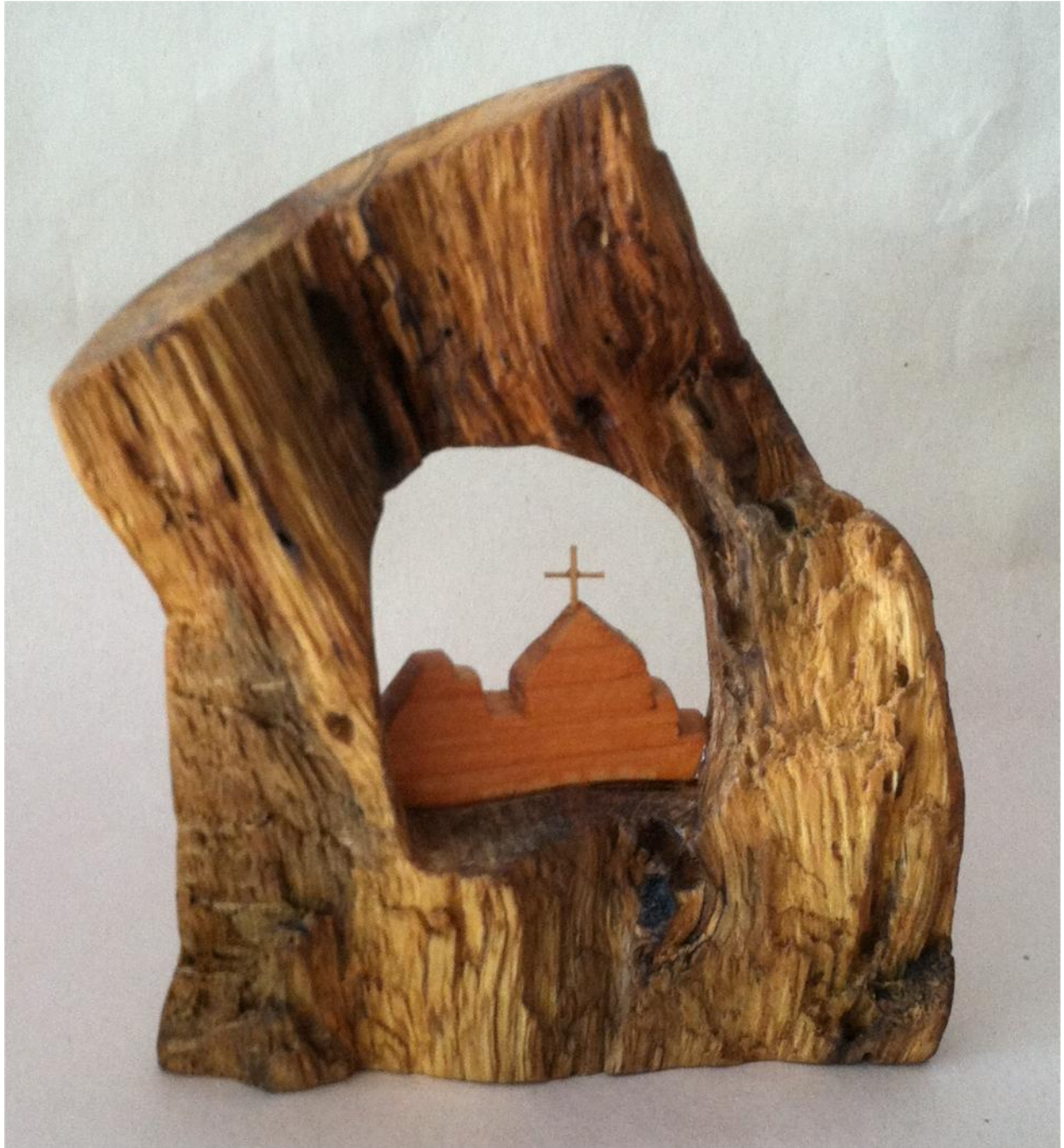
Sacred Mountain V— pine and bamboo on oak