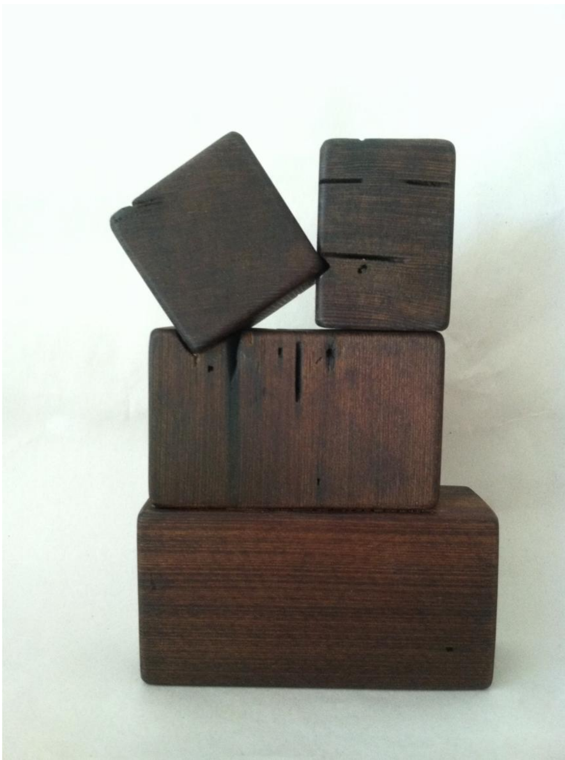
Geometric Composition – old growth redwood, insect carved and recycled from a railroad tie dated 1922.