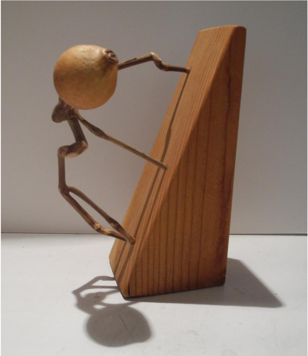
Ant – oak gall and grape vine on pine