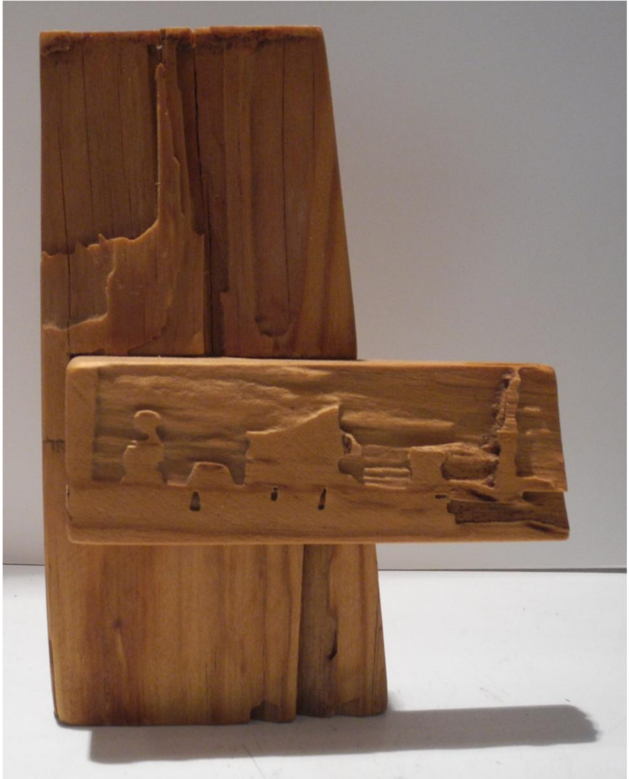
Landscape – pine, termite carved and recycled from an old shed