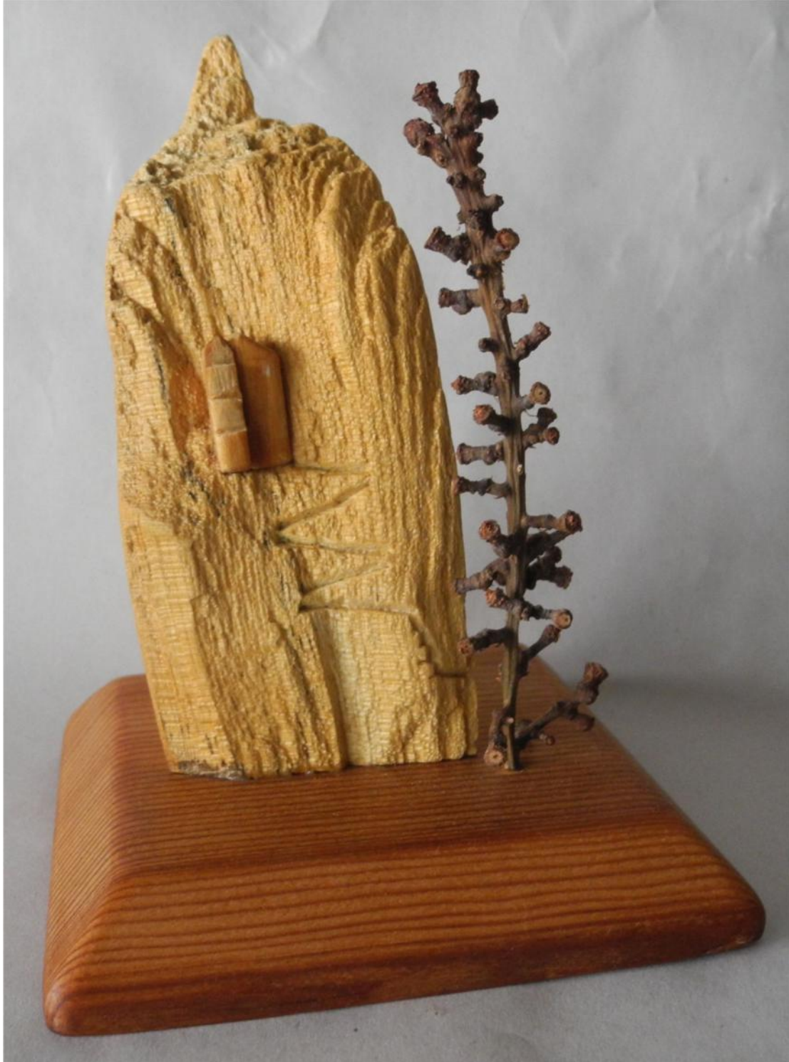
Sacred Mountain III – pine on alder and grape bunch on pine base