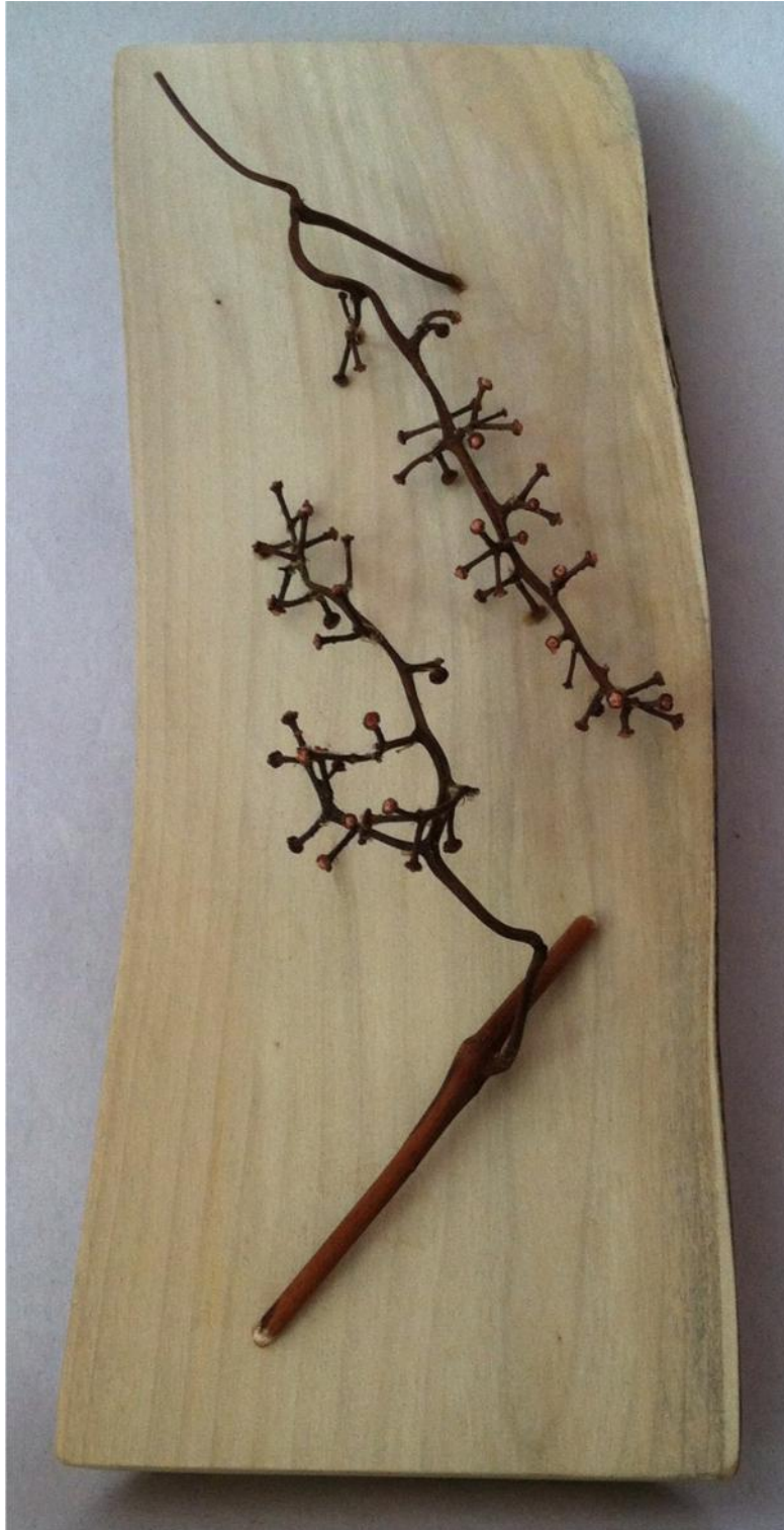
Calligraphy - grape bunch on oleander