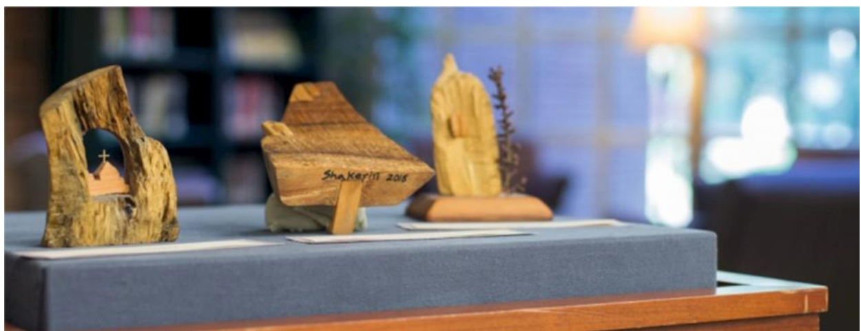
Exhibit poster designed by Nicole Grady, top. Photo of one of the six display cases, bottom.