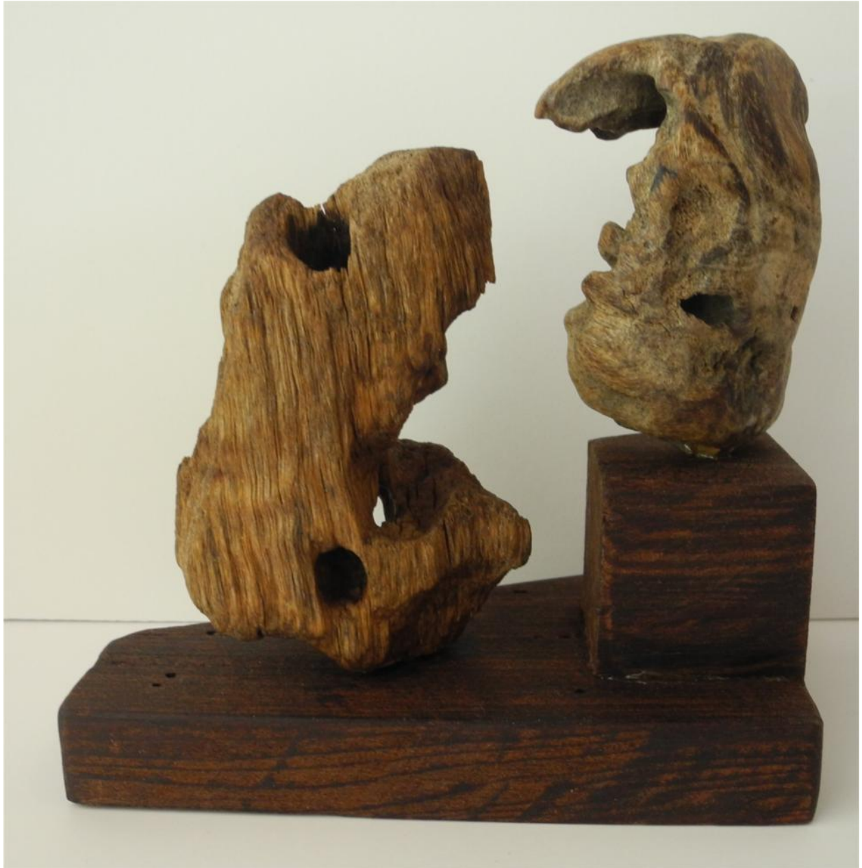
From Master-Disciple series – drift wood on old growth redwood base